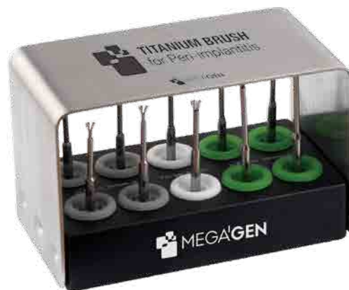
Set: Long(5ea), Short(5ea)